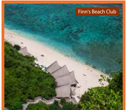
Finn's Beach Club