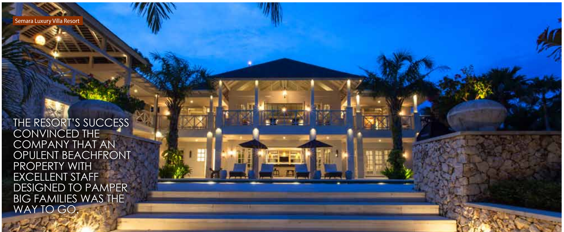
Semara Luxury Villa Resort

The fee includes use of inclinator, food and beverage credit, towels, sunbeds, stand-up paddle boards, kayak, snorkeling equipment and free wi-fi.