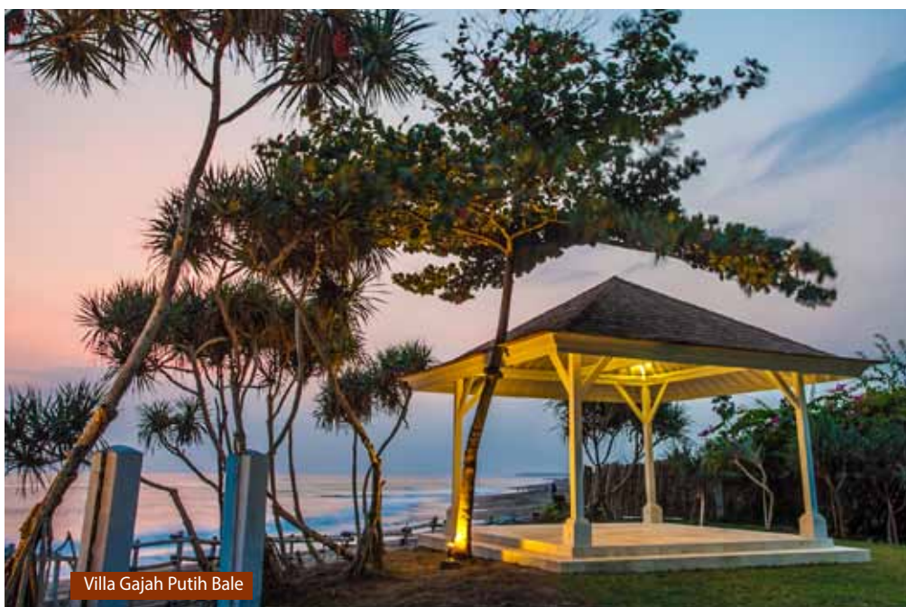
Villa Gajah Putih Bale

Each bedroom is air-conditioned with an en suite bathroom. The floor and ceiling of the bedrooms are of unique polished ironwood, and each bedroom has at least one glass wall overlooking the ocean or gardens of the property.