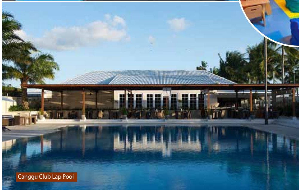
Canggu Club Lap Pool

With attractive properties ranging from an immensely popular villa resort and beach club in Uluwatu to a club boasting the island's most comprehensive sporting facilities for kids in Canggu; the properties of the Semara Collection have succeeded in booking a large and lavish place for themselves in Bali's hospitality landscape.