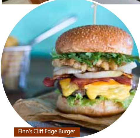
Finn's Cliff Edge Burger

The bathrooms have marble walls and floors, with large, high-screened windows and plantation shutters to allow circulation and keep out insects. Most bathrooms have double vanity sinks, double showers, a large bathtub and bidets.