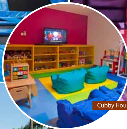
Cubby House Kids Club