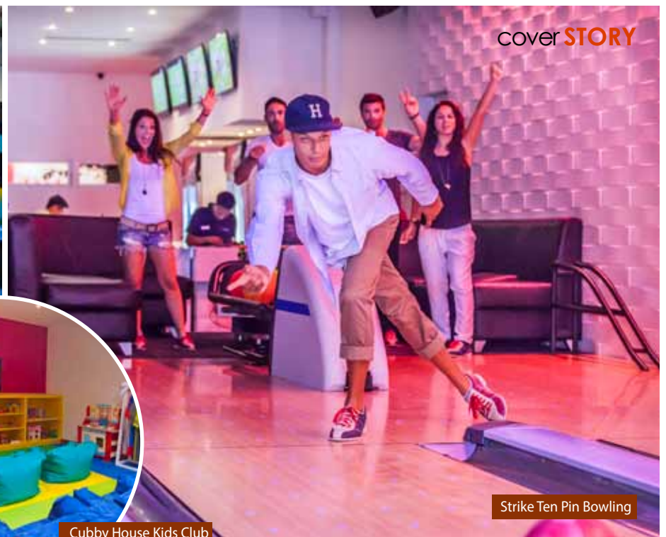
Strike Ten Pin Bowling