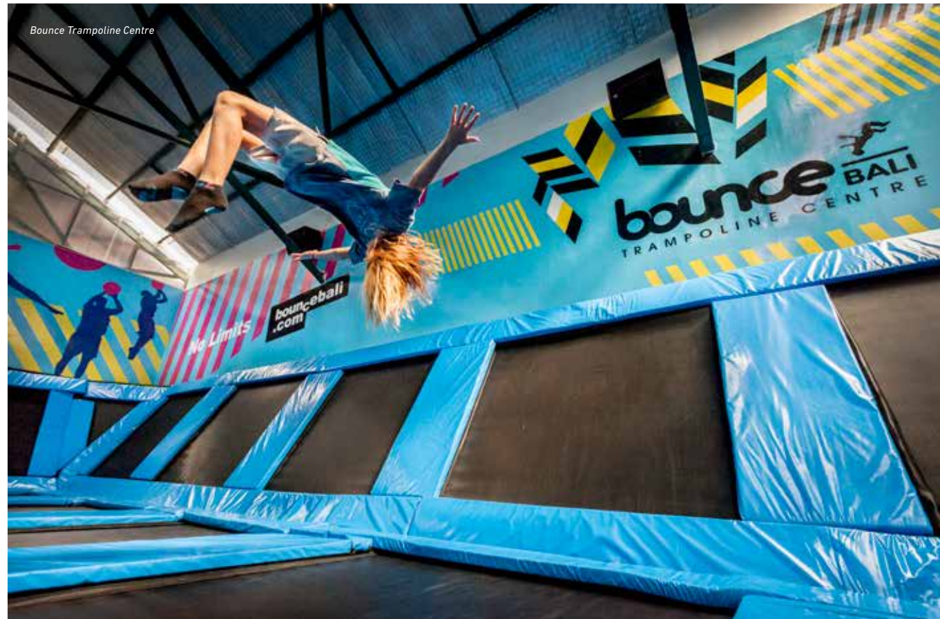
Bounce Trampoline Centre

manicured, fully fenced sporting field is ready to host a game of football or two. For those who are into the love match, the indoor tennis centre – complete with coaches and hitting partners – are also available. Of course, afterwards you can clean and freshen up in the ladies' or gents' locker rooms with sauna, steam rooms and showers.