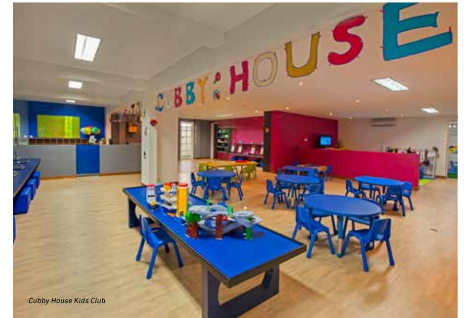
Cubby House Kids Club

Finns Recreation Club is also the go-to place to kill time before your red-eye flight. The staff will store your luggage securely so that you and the family can