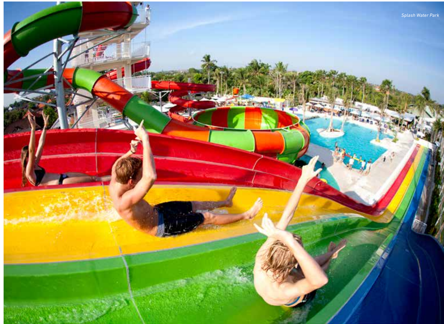
Splash Water Park

To further sate any sporty family's hunger to get active, Finns Recreation Club has a 25m lap pool and a fully equipped fitness centre that offers a range of up-to-the-minute classes, sessions with personal trainers and the latest in high-tech gym equipment. Meanwhile, Bali's best