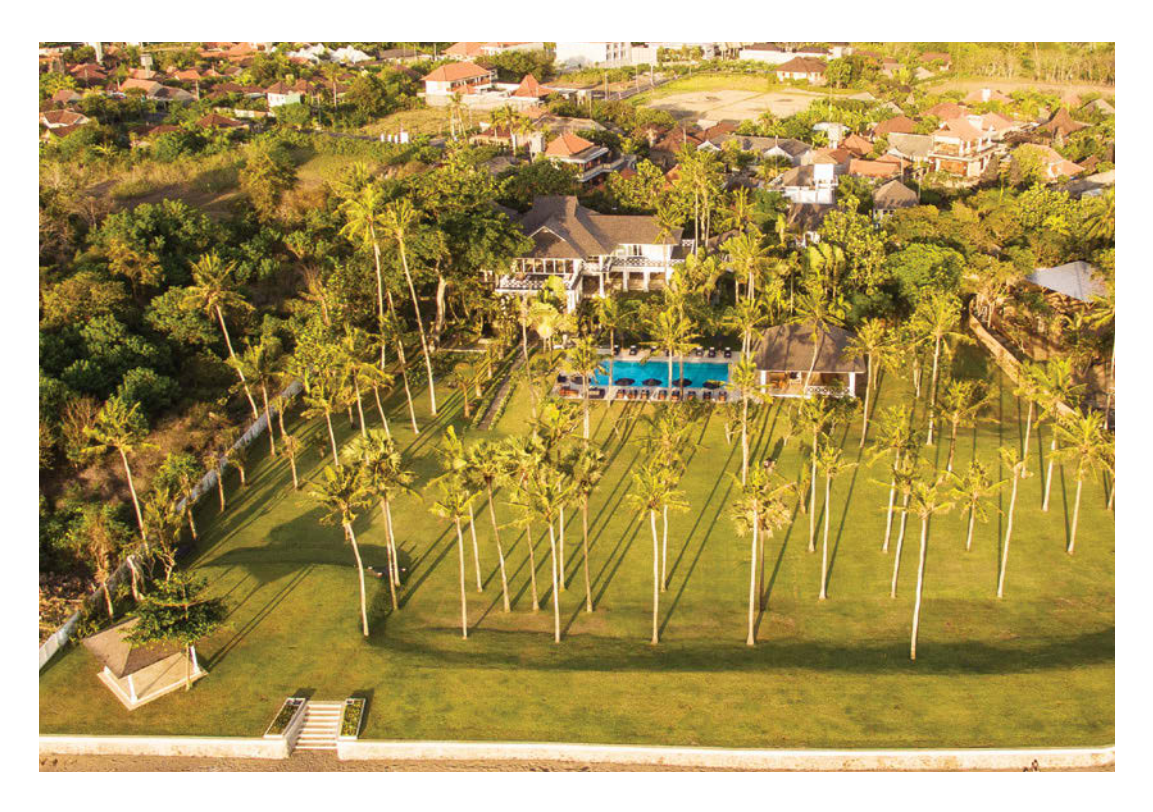
The overview. The 1.33 hectare property right on the beach.

and being right on the beach at Berawa means they are never far from the action that neighbouring Seminyak or the now popular Batu Bolong offer. A quick dip in the ocean or the expansive swimming pool is easily accessible too.