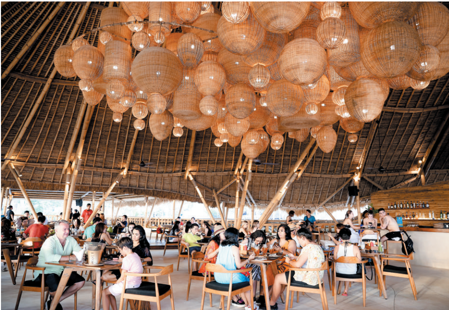
FINNS BEACH CLUB, BALI HAS A WIDE RANGE OF FACILITIES FOR GUESTS. 巴厘岛的FINNS BEACH CLUB为客人提供各式各样设施

“Compared with luxury hotels and resorts in Phuket, Dream Beach Club is a better place for relaxation with an authentic tropical ambience because of its large open-air venue, which is surrounded by the pools and spacious sunbeds,