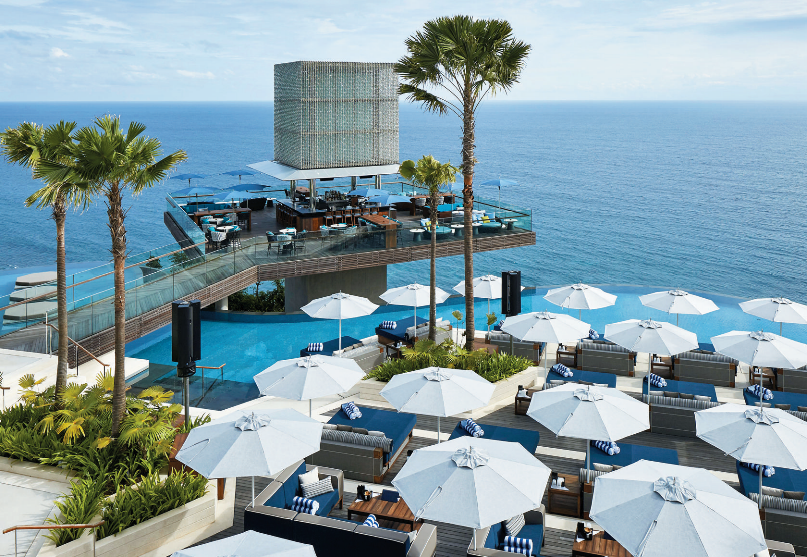
OMNIA DAYCLUB BALI MAKES THE MOST OF THE PROPERTY'S PANORAMIC VIEWS OF THE INDIAN OCEAN. OMNIA DAYCLUB BALI坐拥360度无死角的优美印度洋全海景

people, while the mezzanine-level dining room of the Japanese restaurant can seat up to 120 guests. For larger events, the entire club can also be bought out for up to 2,000 people. The club has a strict over-21 minimum age for guests, making it the only adult-only beach club in Bali.