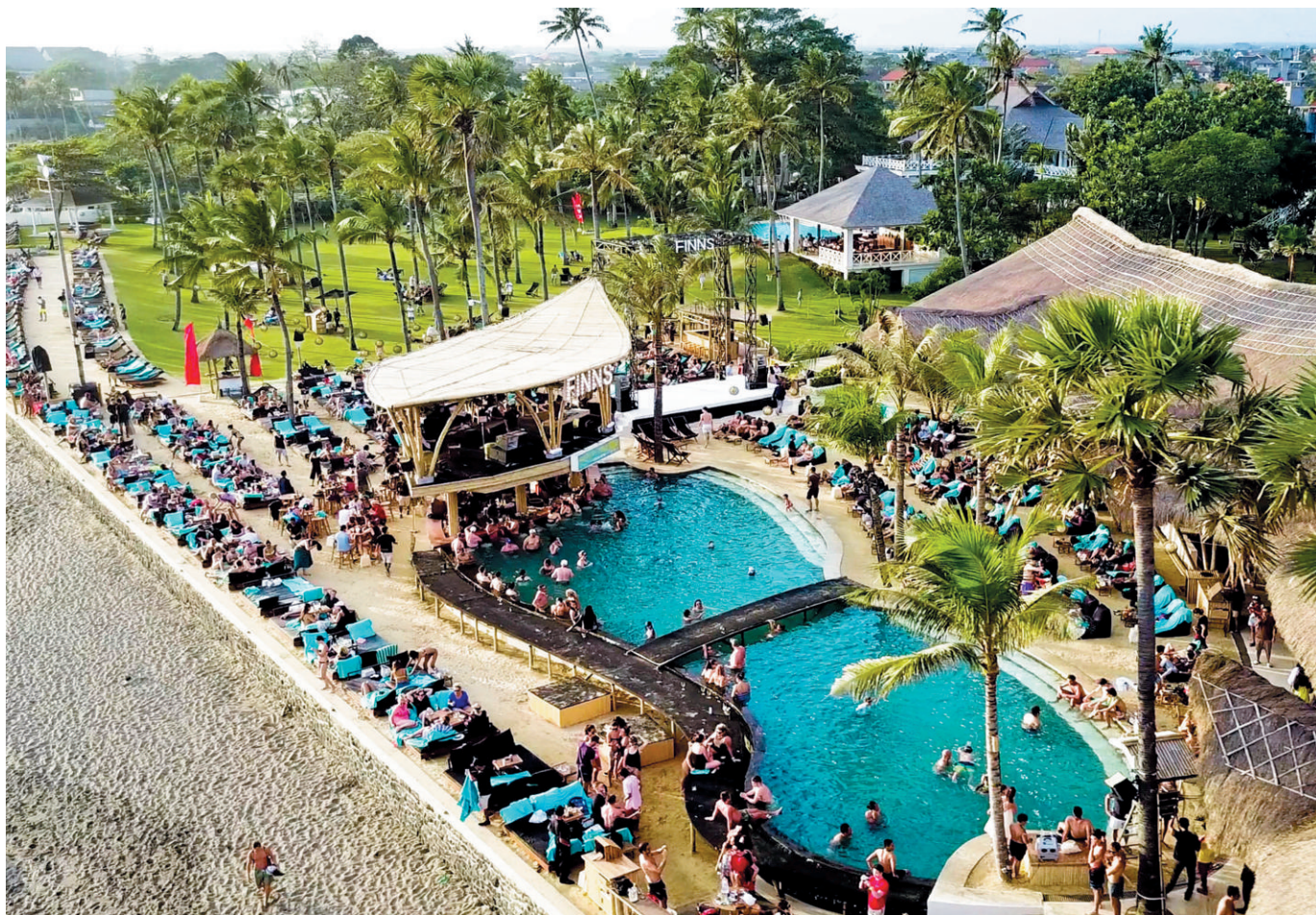
FINNS BEACH CLUB HAS 85 METRES OF BEACHFRONT IN BERAU, BALI THAT CAN CATER FOR 700 PEOPLE AT A SEATED EVENT OR 1,400 FOR STANDING COCKTAILS. FINNS BEACH CLUB拥有85米的海滩区域，可用作举办700人的会议或1,400人的站式鸡尾酒会。

彩体验。我们拥有巴厘岛罕见的宽敞空间，客户可以在此尽情享受大自然的新鲜空气，体验巴厘岛令人叹为观止的日落美景，而不是枯燥地待在会议室里进行毫无灵性的活动。”该度假村的发言人表示。