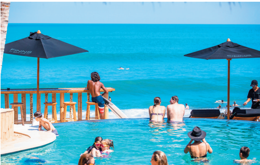
THE POOL AT FINNS BEACH CLUB HAS BEAUTIFUL VIEWS, ESPECIALLY AT SUNSET. FINNS BEACH CLUB的游泳池坐拥迷人景致，观赏夕阳尤其是一大享受

仅170米，是巴厘岛颇受欢迎的冲浪海滩，客人可以在那里观看冲浪表演。该俱乐部的设计充分利用了大洋彼岸的落日景观，打造出令人流连忘返的夕阳美景。俱乐部提供日间床、豆包椅沙发、酒吧、餐饮设施和每日驻场DJ。附近的姐妹俱乐部Finns Recreation Club (FRC) 则为各年龄层游客提供一系列娱乐设施和活动项目，包括喷泉公园、蹦床中心、保龄球中心、网球中心和其他健身设施，如艺术体育馆和25米游泳池。