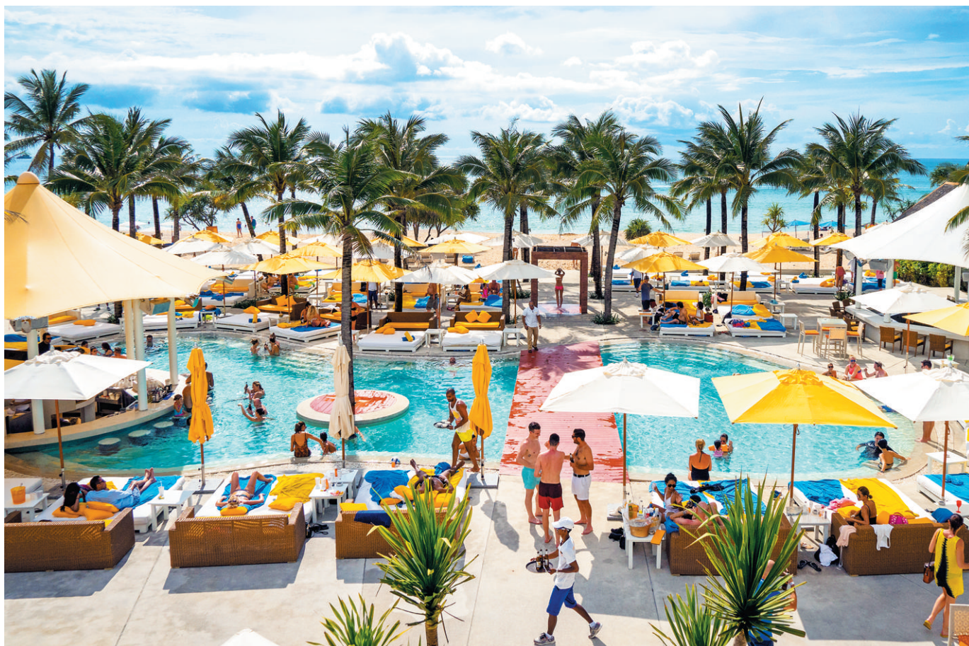
THE POOL AREA AT DREAM BEACH CLUB, PHUKET IS A FINE PLACE TO RELAX AFTER A BUSY MEETING. DREAM BEACH CLUB的游泳池区。繁忙会议之后，普吉岛是一个放松休闲的好地方。