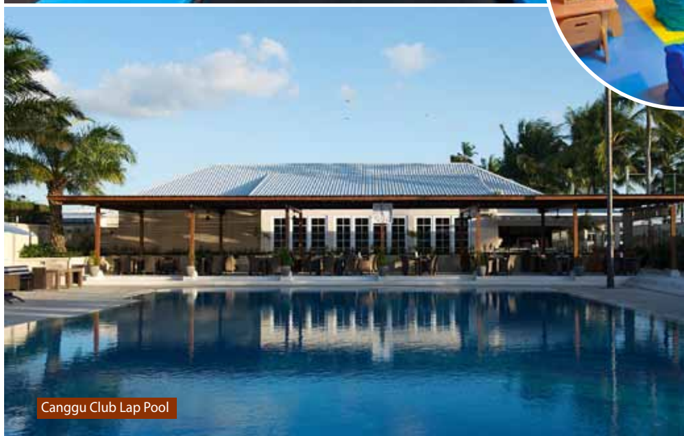
Canggu Club Lap Pool

With attractive properties ranging from an immensely popular villa resort and beach club in Uluwatu to a club boasting the island's most comprehensive sporting facilities for kids in Canggu; the properties of the Semara Collection have succeeded in booking a large and lavish place for themselves in Bali's hospitality landscape.