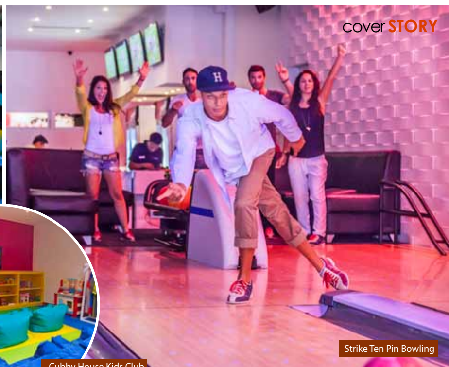
Strike Ten Pin Bowling