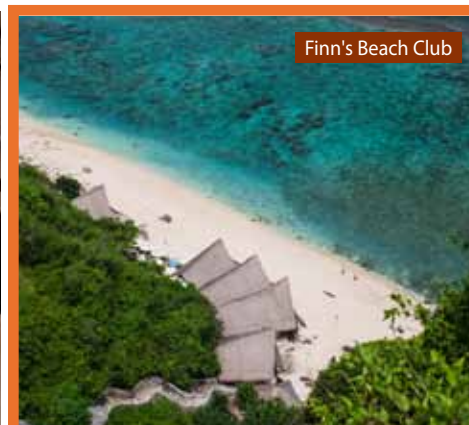
Finn's Beach Club