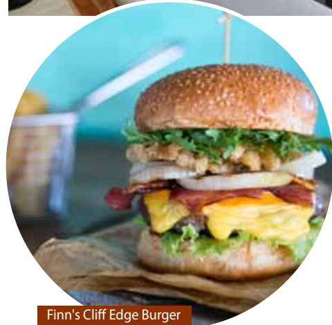
Finn's Cliff Edge Burger

The bathrooms have marble walls and floors, with large, high-screened windows and plantation shutters to allow circulation and keep out insects. Most bathrooms have double vanity sinks, double showers, a large bathtub and bidets.