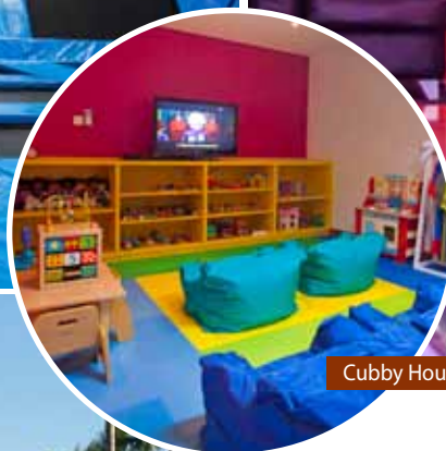
Cubby House Kids Club