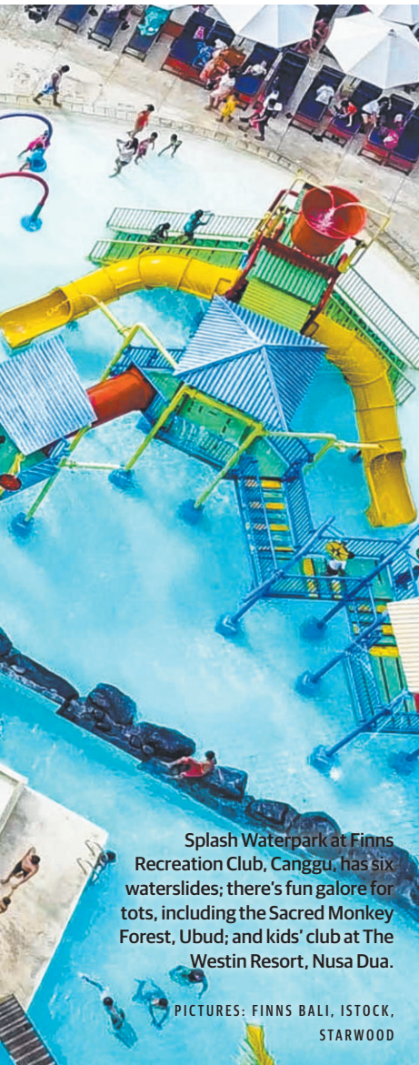
Splash Waterpark at Finns Recreation Club, Canggu, has six waterslides; there's fun galore for tots, including the Sacred Monkey Forest, Ubud; and kids' club at The Westin Resort, Nusa Dua.