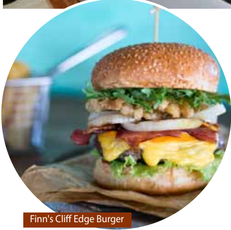
Finn's Cliff Edge Burger

The bathrooms have marble walls and floors, with large, high-screened windows and plantation shutters to allow circulation and keep out insects. Most bathrooms have double vanity sinks, double showers, a large bathtub and bidets.